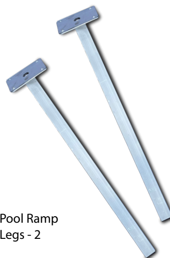
Pool Ramp Legs - 2