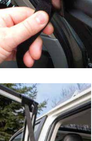
The Side Entry Support Strap will now be secured in place and supporting the corner of the ramp, preventing it from tipping.