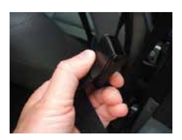
Lift the tab on the adjustment buckle to change the length of the strap if needed to make it taught. Relock the tab to secure the strap.

Place the large black hook at the other end of the strap over the car door window frame.