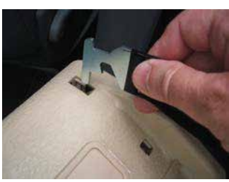
Insert the silver ramp hook into the slot at the unsupported top corner of the PetStep ramp. (The other corner rests on the car seat.)