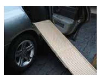
Place your PetStep ramp in position through the side door of your vehicle, resting on the car seat.

Use the enclosed Side Entry Support Strap to keep your PetStep® Folding Pet Ramp secure and stable when used for side door entry