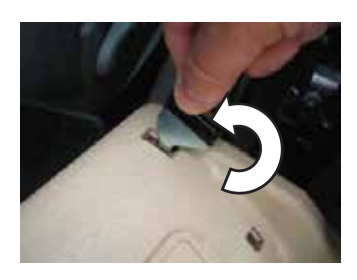
Rotate the hook into the position as shown to secure it into the ramp.